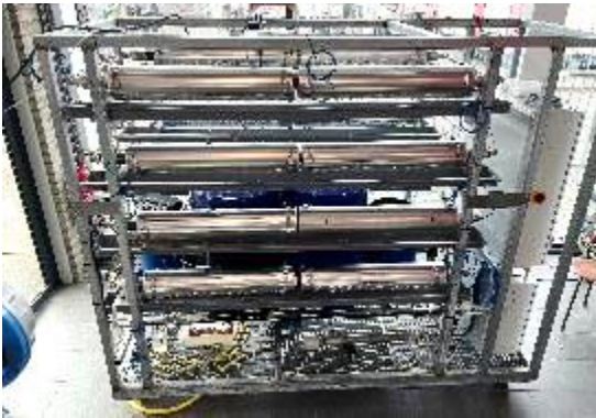
Simulated industrial environment